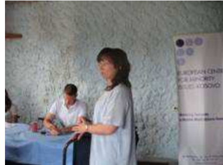
Round table on decentralisation in Novo Brdo

During the reporting period ECMI Kosovo organised round tables for Serb Women's NGOs in Fushe Kosove/Kosovo Polje and in Novobërdë/Novo Brdo. These round tables were intended to increase the awareness of Serb women about the decentralisation process and the establishment of the Municipal Preparatory Teams. ECMI Kosovo also continued its support to the creation of Municipal Preparatory Teams, by distributing application forms and providing information regarding the application procedure to community members. Finally, ECMI Kosovo attended several meetings of the Information Campaign Group in which the final version of its action plan was agreed on.